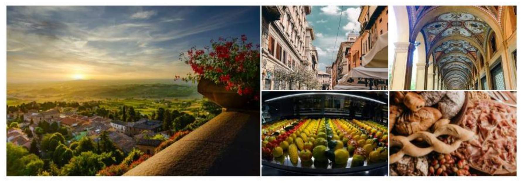
Wine & Dine autorondreis A taste of Emilia Romagna ★★★